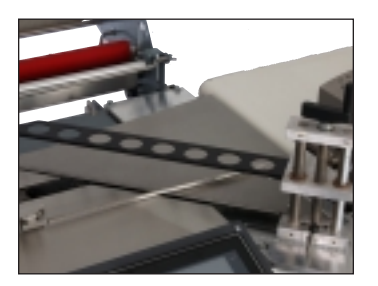
Adjustable Inverting Head (HS-1 and HS-3 only)