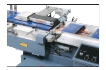
Synchronic Overhead Belt Infeed