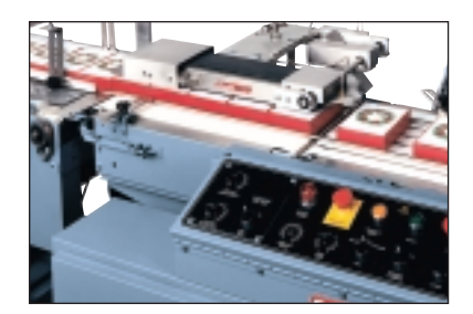
Harmonic Overhead Infeed