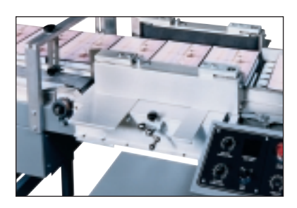
Harmonic Side Belt Infeed