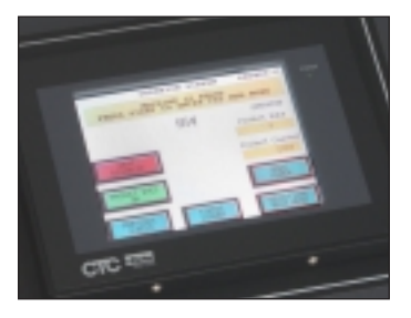
Full Color Touch Screen