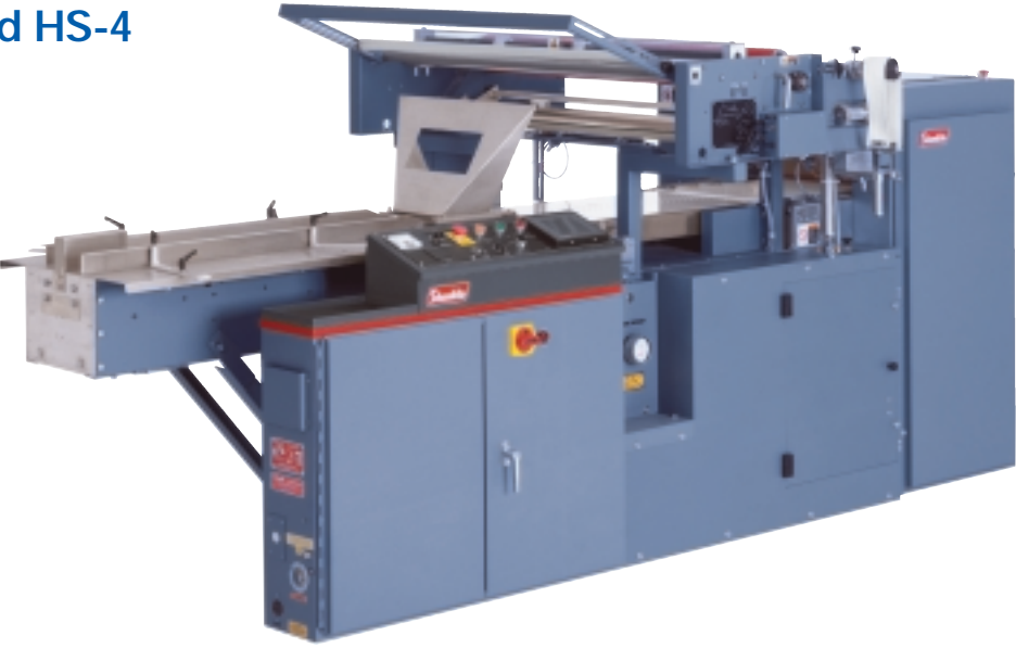
HS-2/HS-4 High Speed Automatic Wrapper

Ruggedly built Shanklin HS-2 and HS-4 wrappers are our overlap-sealing models that combine high speed and smooth product travel with quick and easy size change for the ultimate packaging performance! These machines produce packages with neat trim seals on both ends and a transparent overlap seam on the bottom. HS-2 and HS-4 feature convenient one-person film loading capability and are especially well suited for wrapping irregular-shaped product.