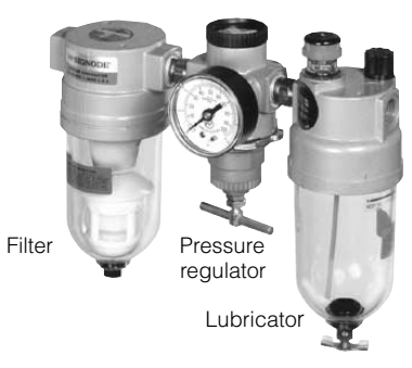
Filter-Regulator-Lubricator assembly (Part No. 173111)

All new Signode® pneumatic tools are supplied with a quick-disconnect plug. A filter and regulator are needed with all Signode pneumatic sealers. A filterregulator-lubricator is needed with pneumatic tensioners and combination tools. These additional fittings and air hoses are available from Signode to provide efficient installation.